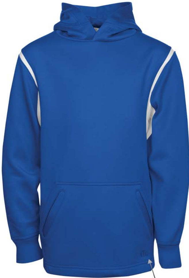
Tonal "ATC" embroidery on left hip