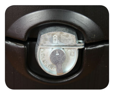
NEW push & turn locking mechanism